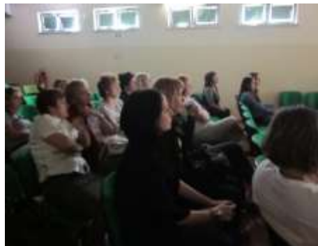
Teams made conclusions about the quiz results

In the evening, another experience about Lisbon and the World Heritage Song – the Fado.