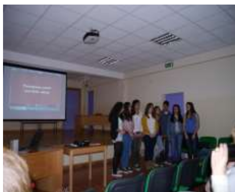
Presentation of the films produced by students

Films on teenagers values were also presented by students and cultural differences were discussed.