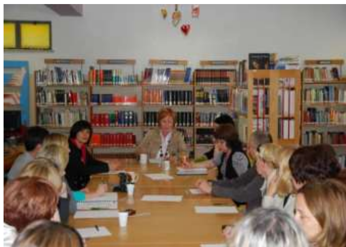
Work session on next meeting – Poland camp

Program next meeting in Poland, strategies and aims as well the next activities on the project about the media and the interaction with the different generations were discussed points during the workshops.