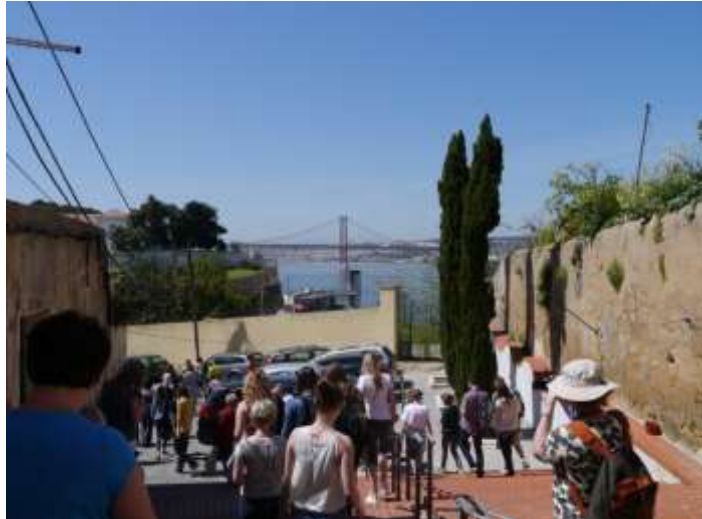
Visiting and learning about local heritage and costumes on a guided visit

The Tourism has provided a guided tour (Tuesday, 17 th April) around neighborhoods to visit the old town (Casa da Cerca, Panoramic Elevator, Pipe Fountain, Naval Museum, Cristo Rei) and Convento dos Capuchos Belvedere in Costa de Caparica.