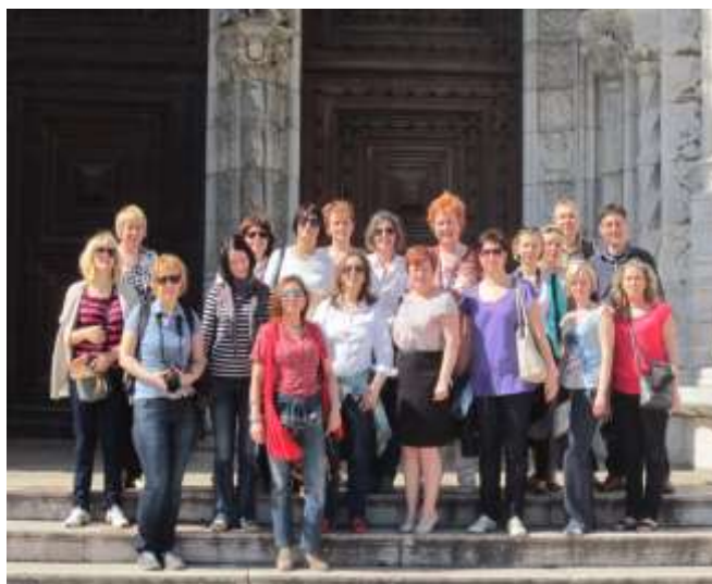
Teams at Belém, visiting historic monuments

They also went inside number 84 of the Rua de Belém, in a factory founded in 1837 with azulejo panels from the XVIIIth century, almost as famous as the sweet pastries sold there, the famous Pastéis de Belém.