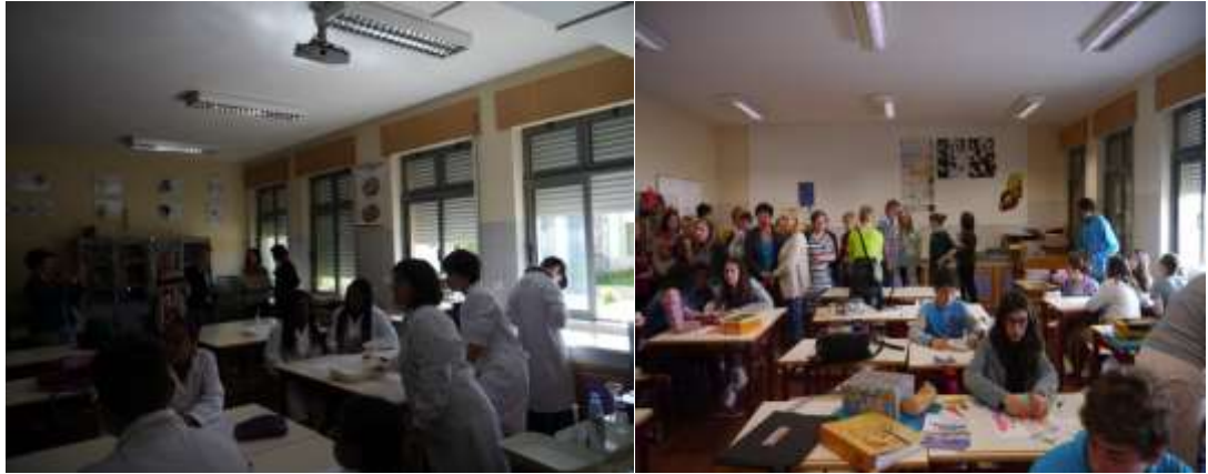
Teams visiting different classes

In the evening, another experience about Lisbon and the World Heritage Song – the Fado.