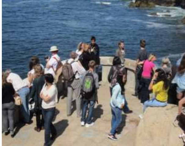
Teams exploring our oceanic landscape

The time also permitted to visit (Friday, 20 th April) some famous Portuguese sights like Estoril, Cascais, Boca do Inferno, Cabo da Roca (the western part of Europe) and Sintra, contacting with Portuguese landscape and culture.